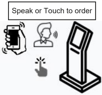
Wall mount model